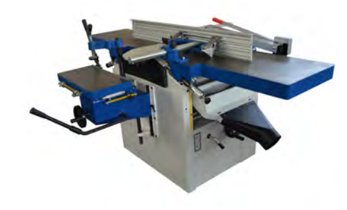
SUCTION HOOD OF LARGE DIMENSIONS

The machine can be equipped with a largesized cutting unit with a 0 - 16 mm wescott spindle.