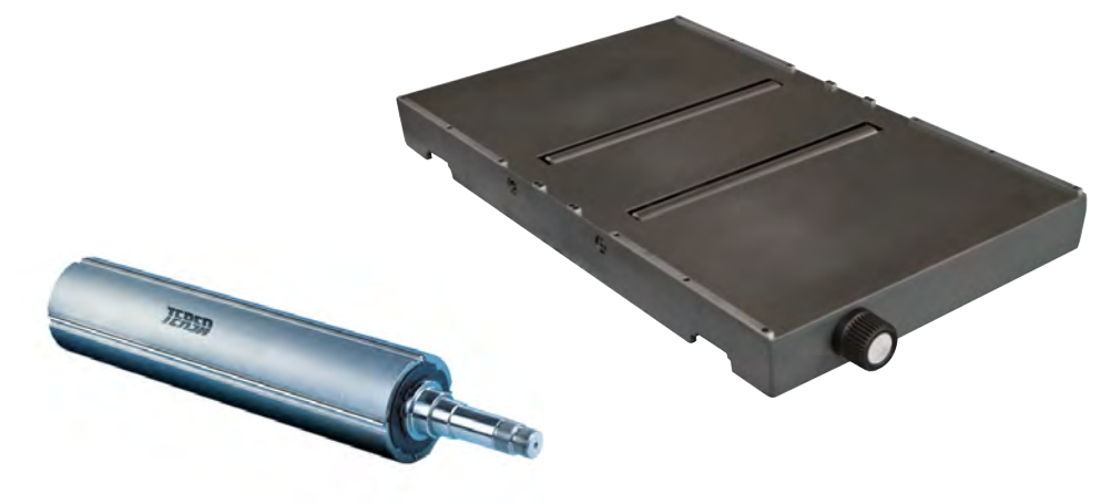
TERSA PLANER SHAFT

The thickness plate can be accessorized with 2 adjustable rollers, to guarantee a safe towing even in the worst working conditions.